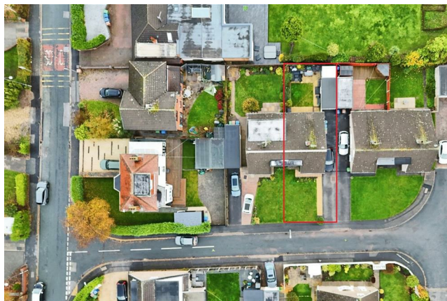
Aerial view of the property

The residence also benefits from having an outside tap.