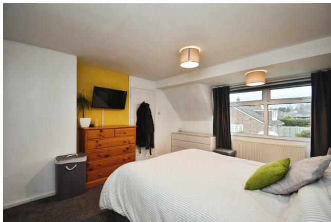
Bedroom one 14'3" x 11'9" maximum (4.35 x 3.59 maximum )

UPVC double glazed window, central heating