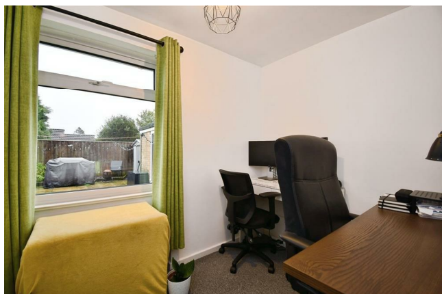
Bedroom three 7'1" x 8'1" (2.18 x 2.48 )

UPVC double glazed window, central heating radiator, and carpeted flooring.